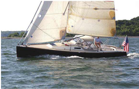
Manufacturer Provided Image